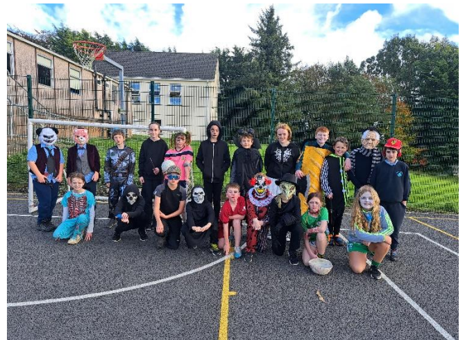
5 TH & 6 TH CLASS