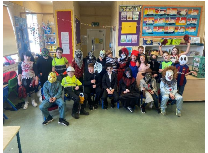
3 RD & 4 TH CLASS