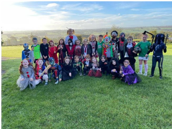
1 ST & 2 ND CLASS