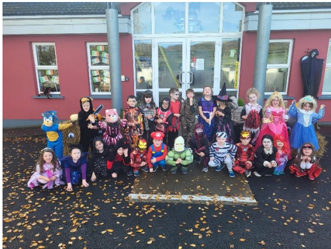
JUNIOR & SENIOR INFANTS